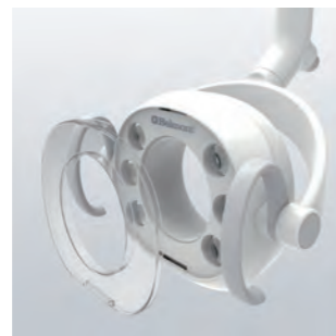
Detachable light cover The lens cover can be removed with a single lever action for easy cleaning.