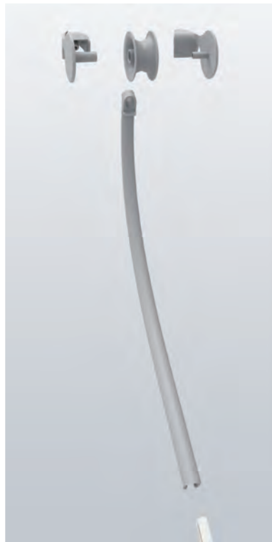
Dismantling of the rod holder The end parts of the rod can easily be dismantled for cleaning.

The hygienic condition inside the chair unit is maintained by water line flushing, so that patient-friendly treatment can be administered. As an environmentally friendly option, the unit comes with a separator or a separator with an amalgam collector, which helps reduce facilitating everyday maintenance.