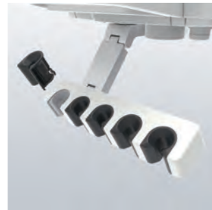
Detachable holder The dentist outlets and the assistant outlets can both be detached for cleaning.