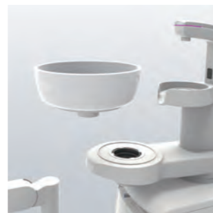
Detachable bowl The ceramic bowl can easily be detached for cleaning and can therefore always be in a clean condition.