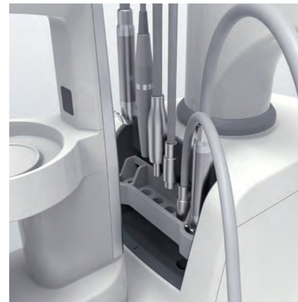
Flushing system Option The integrated handpiece flushing system inhibits biofilm build up and bacterial growth in the handpieces hoses.