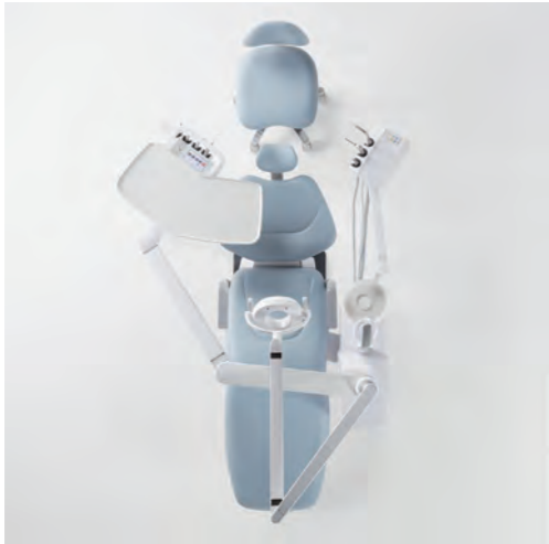
Two-hand The long reach and light movement of the arm facilitate two-hand treatment to be administered without stress.

The compactly designed chair unit can be installed in a space as narrow as 1,8m across for full use of its capabilities, allowing enough workspace for both two-hand and four-hand treatment. The over-arm is fitted for treatment in both standing and sitting positions. The dentist/dental assistant can efficiently administer treatment from various orientations from the 8 o'clock to 2 o'clock directions.