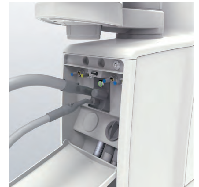
Vacuum Line Clean System Option Daily use of the integrated suction cleaning system prevents build-up of debris in the vacuum line and helps to maintain constant suction.