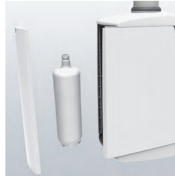
Water bottle Option