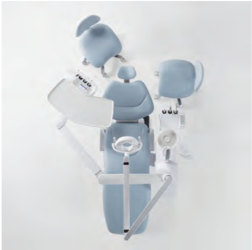
Four-hand In four-hand position, the large tabletop provides a common space for the dentist and the assistant, facilitating smooth treatment.