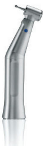
STATIS 1.1L Mat. No. S20001