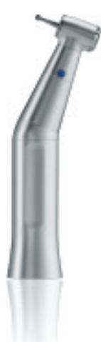
STATIS 1.1 Mat. No. S20002