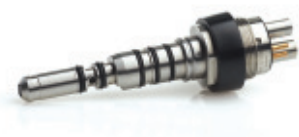
Couplings for STATIS High speed handpieces

E-STATIS Display Extension kit Mat. No. S21103