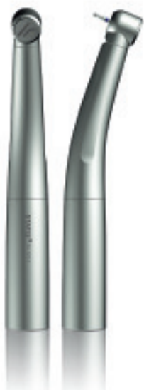
STATIS ML Mat.-No. S10000 STATIS SL Mat.-No. S10001