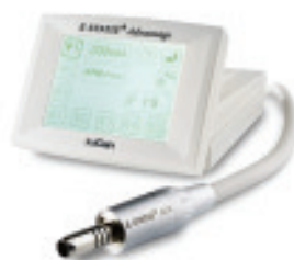
E-STATIS™ Electric motor system

E-STATIS Advantage Electric Handpiece System Mat. No. S21200