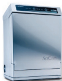
STATMATIC Automatic handpiece maintenance unit