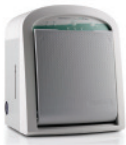
STATMATIC™ PLUS Automatic handpiece cleaning & lubrication station